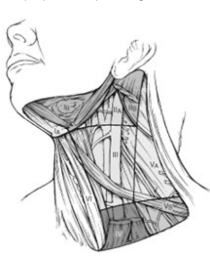
Figure 3. The 6 sublevels of the neck for describing the location of lymph nodes within levels I, II, and V. Level IA, submental group; level IB, submandibular group; level IIA, upper jugular nodes along the carotid sheath, including the subdigastric group; level IIB, upper jugular nodes in the submuscular recess; level VA, spinal accessory nodes; and level VB, the supraclavicular and transverse cervical nodes.

For purposes of pathologic evaluation, lymph nodes are organized by levels as shown in Figure 3. 12